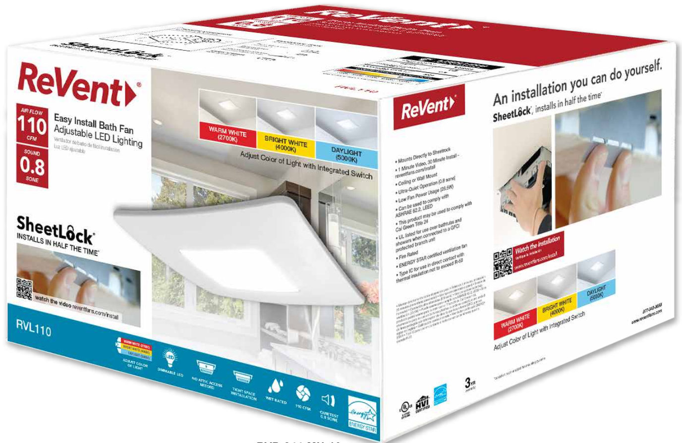
RVP-244-MU-10 box (shown closed and sealed)