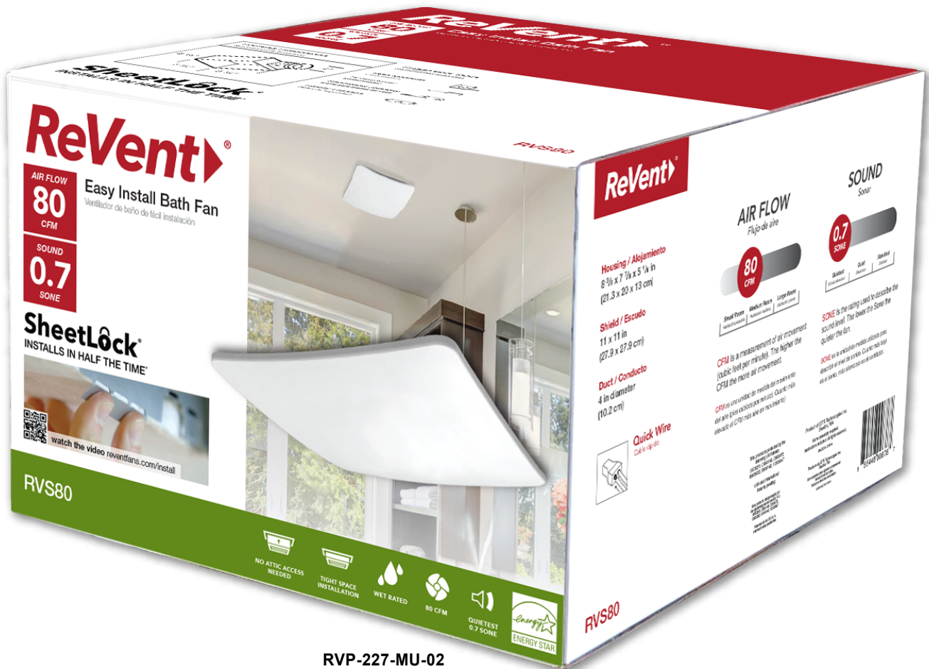
RVP-227-MU-02 box (shown closed and sealed)