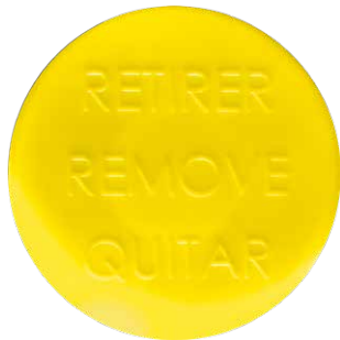
RVP-829-YL-01 4" damper cover